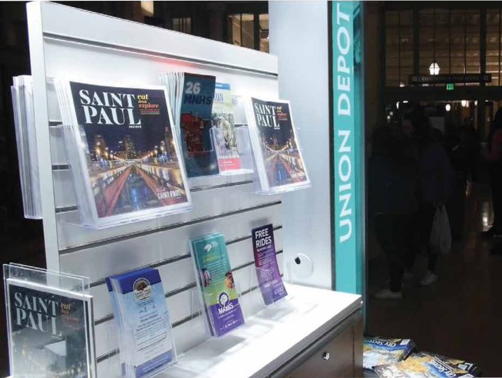
The Insider's Guide is displayed at Union Depot year-round.