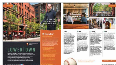
2017 Insider's Guide - cover & inside spread

Visit Saint Paul members receive a complimentary directory listing in the Saint Paul Insider's Guide. Increase your visibility with a display ad - Reserve space today!