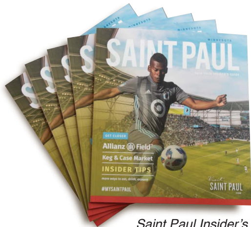
Saint Paul Insider's Guide

Provide your attendees with a special welcome letter from the Mayor and/or Visit Saint Paul CEO.